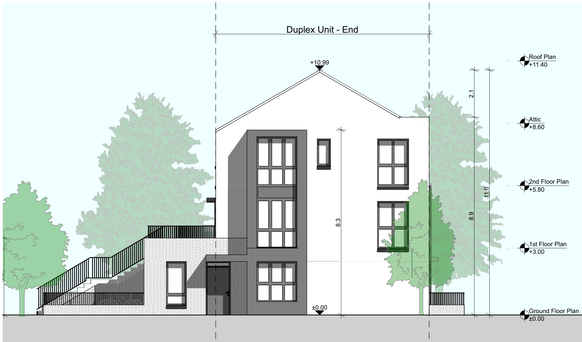
SIDE ELEVATION 01 SCALE 1:100