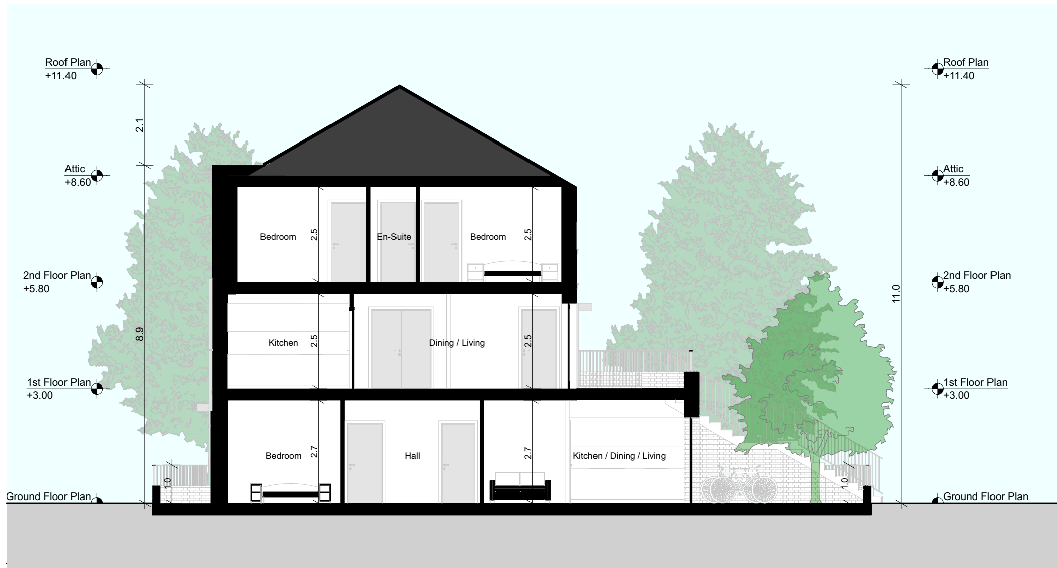
SECTION 01 SCALE 1:100